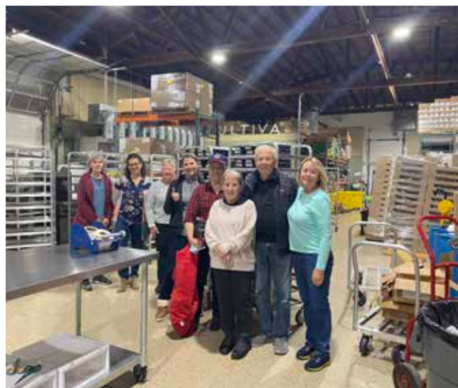
Members volunteering at Cultivate assembled 376 meals to be given to food insecure children.