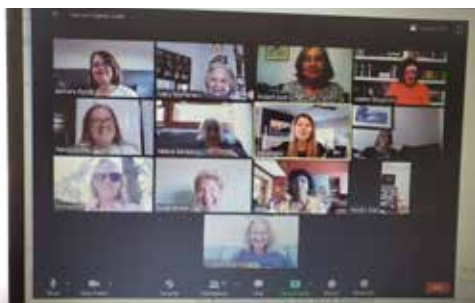
The Afternoon Book Club has been meeting online each month.

The Afternoon Book Club (known affectionately as the ABC group) is a group of women who love to read! We meet the first Thursday of every month at 1:30 PM. During the Covid-19 outbreak we've been meeting on Zoom, and it's been working out well. If the Francis Branch Library meeting room ever reopens, we will go back to meeting there. If you'd like to join our Zoom meeting, just drop us an email, and we will send you the link.