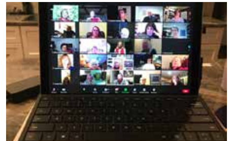
Board Meeting via Zoom