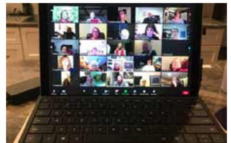
Board Meeting via Zoom