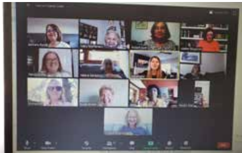
The Afternoon Book Club has been meeting online each month.

The Afternoon Book Club (known affectionately as the ABC group) is a group of women who love to read! We meet the first Thursday of every month at 1:30 PM. During the Covid-19 outbreak we've been meeting on Zoom, and it's been working out well. If the Francis Branch Library meeting room ever reopens, we will go back to meeting there. If you'd like to join our Zoom meeting, just drop us an email, and we will send you the link.