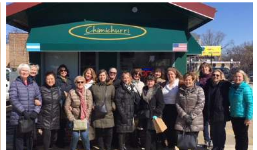
Gems of South Bend outing